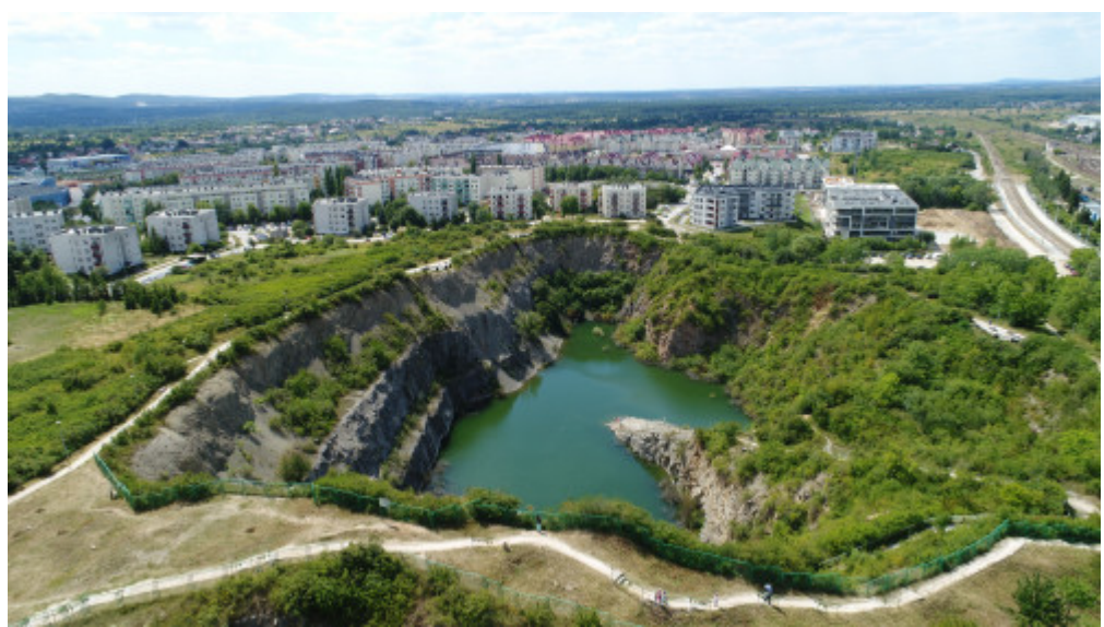
The geological preserve in Kielce - Ślichowice