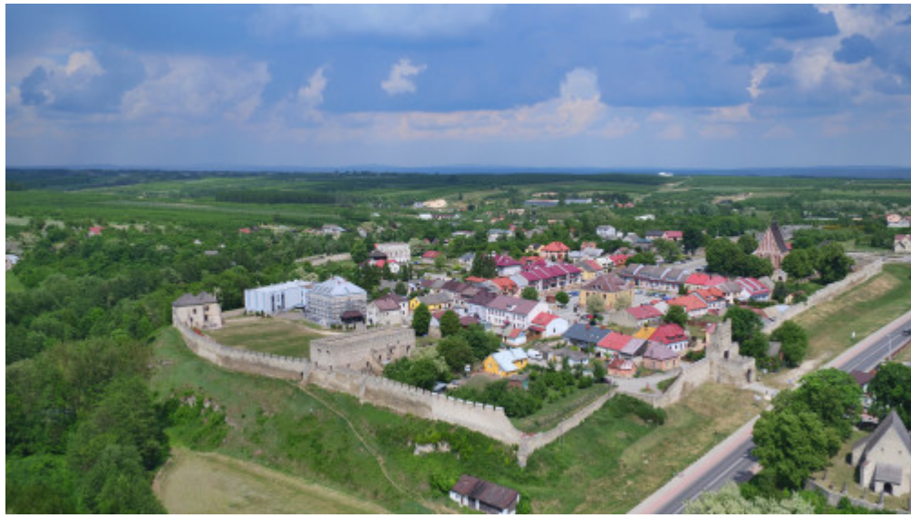
Szydłów, the town called the "Polish Carcassone"