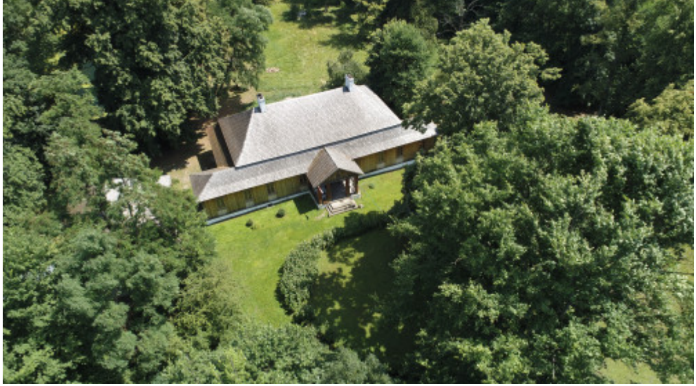
The famous manor house in Ludynia became a favourite setting for filmmakers

The Włoszczowa region is a rural and industrial area but there is also a large spread of forest so the place has a high ecological value. There are oak-hornbeam forests, mixed woodland and in the river valleys – riparian and alder forests. Thick willow bushes grow along the meandering rivers. In places it changes into watery meadows, marshes and peatbogs.