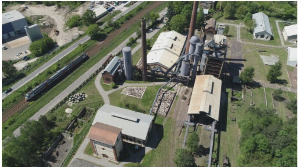
The Muzeum of Nature and Technology in Starachowice

(The Starachowice and Skarżysko Kamienna regions)