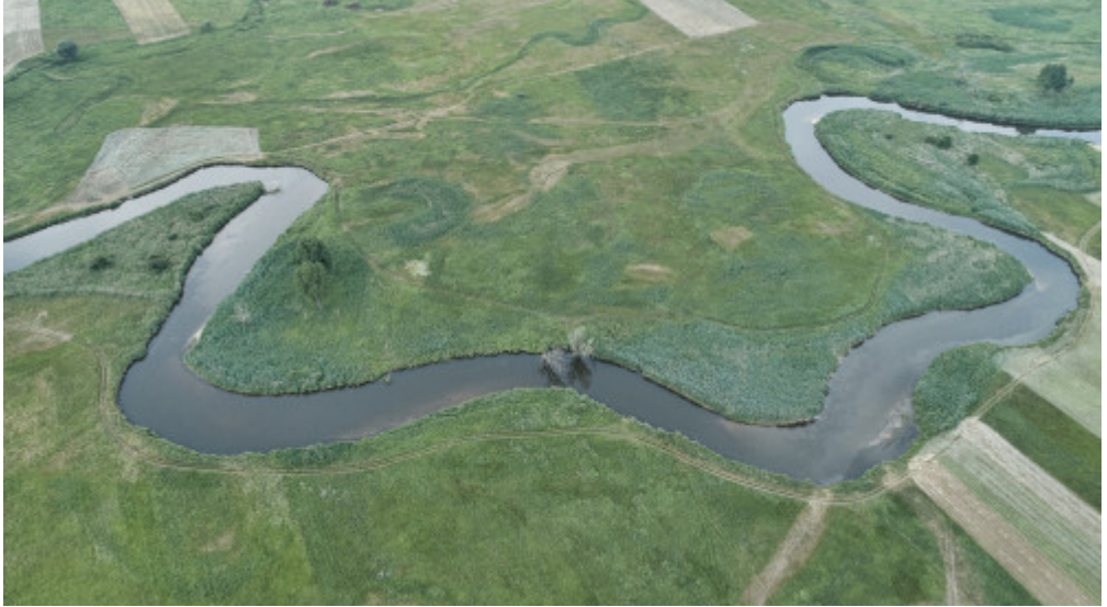
The Nida River

The beauty of Ponidzie fascinates both the residents and tourists. The Nida River, with its meanders and vicinal meadows, encourages the admiration of the beauty of nature while cycling, hiking or canoeing. We can hear the unforgettable sound of cicadas here. There are nature reserves with remarkable swamp and steppe plants. One of the most interesting plant species is the dittany.