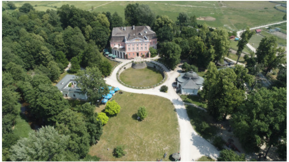
The splendid palace in Kurozwęki

Visiting Szydłów we can feel the medieval spirit of the age of chivalry. The town, called the "Polish Carcassone", amazes visitors with its fortified walls and a piece of a fosse that is still visible.