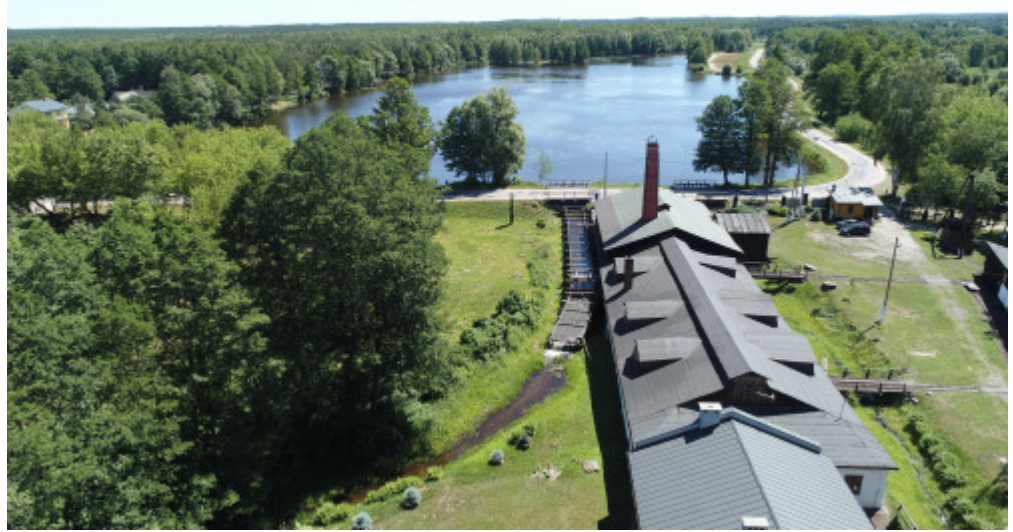
The ancient metallurgical plant in Maleniec

When travelling through the Świętokrzyskie region, it is worth stopping to rest in the Końskie area. We can admire the forest landscape along the Czarna River and its creeks. There are interesting cycle routes and reservoirs such as in Sielpia. Exceptional rock formations are worth seeing, especially in the Piekło Reserve near Niekłań. These Triassic and Jurassic rocks took the form of mushrooms, pulpits and chimneys. What is interesting, near to the settlement called Piekło (Hell), there is also Niebo (Heaven). The Końskie region is also associated with the tradition of heavy industry. Ancient metallurgical plants in Maleniec, Sielpia and Stara Kuźnica are the relics of the time.