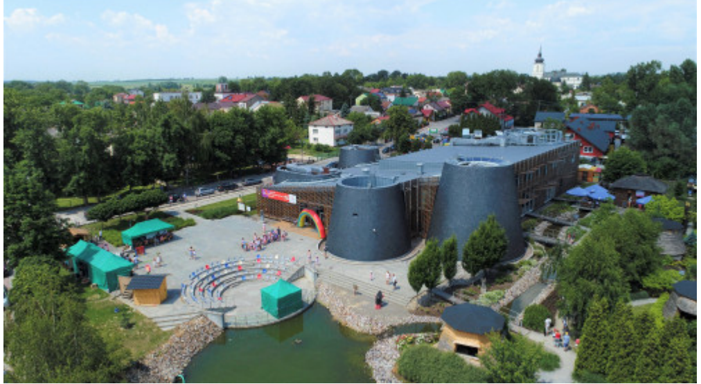
The European Tale Centre in Pacanów

It is worth visiting Busko-Zdrój and Solec-Zdrój to boost your health, physical condition and wellbeing. Patients suffering from rheumatism, orthopaedic, cardiological, neurological, and