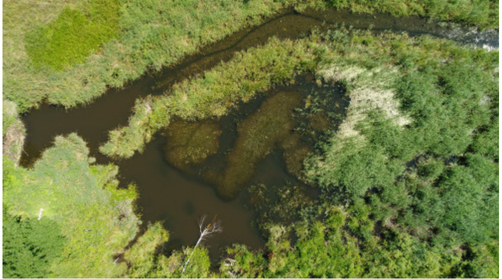
The landscape of the Włoszczowa region is absolutely beautiful