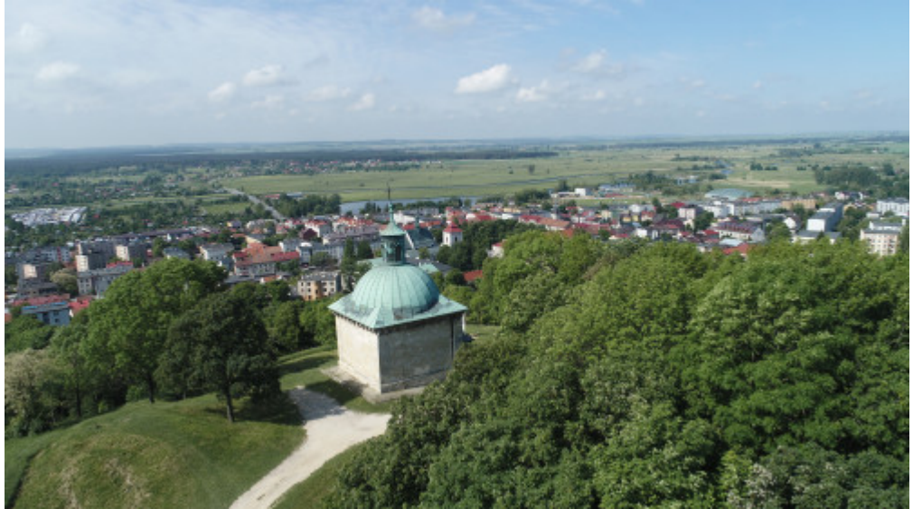
The Chapel of Saint Anne in Pińczów