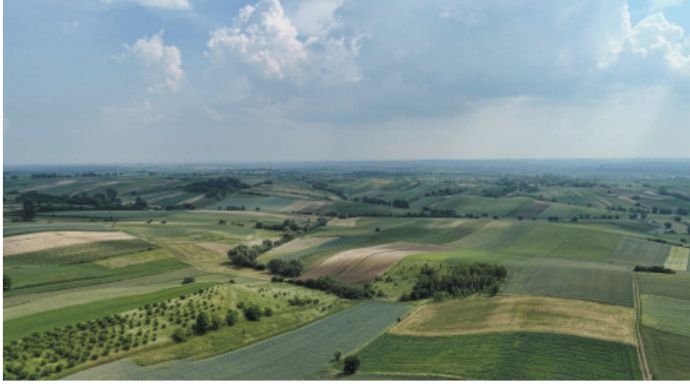
The picturesque view of the Kazimierza Wielka region

The Kazimierza Wielka area is a typical farming region due to the fertile loess soil. Cereal growing, vegetable cultivation and forage crop cultivation are the most common kinds of culture here. There are also ecological farms in this area.