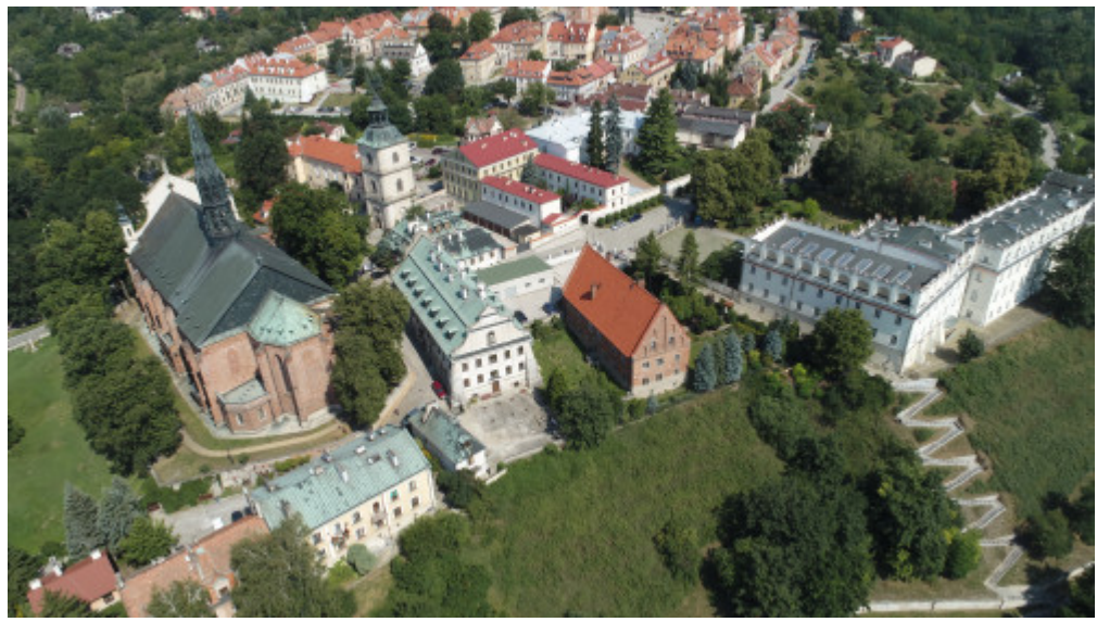
Sandomierz invites lovers of history and monuments