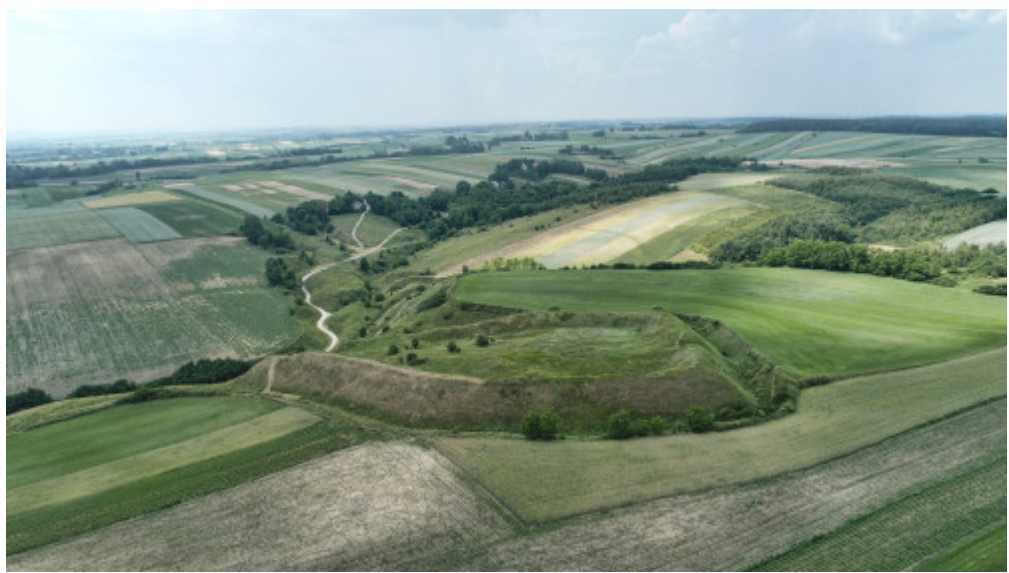
Reminiscences of the Vistulan tribe fort in Stradów