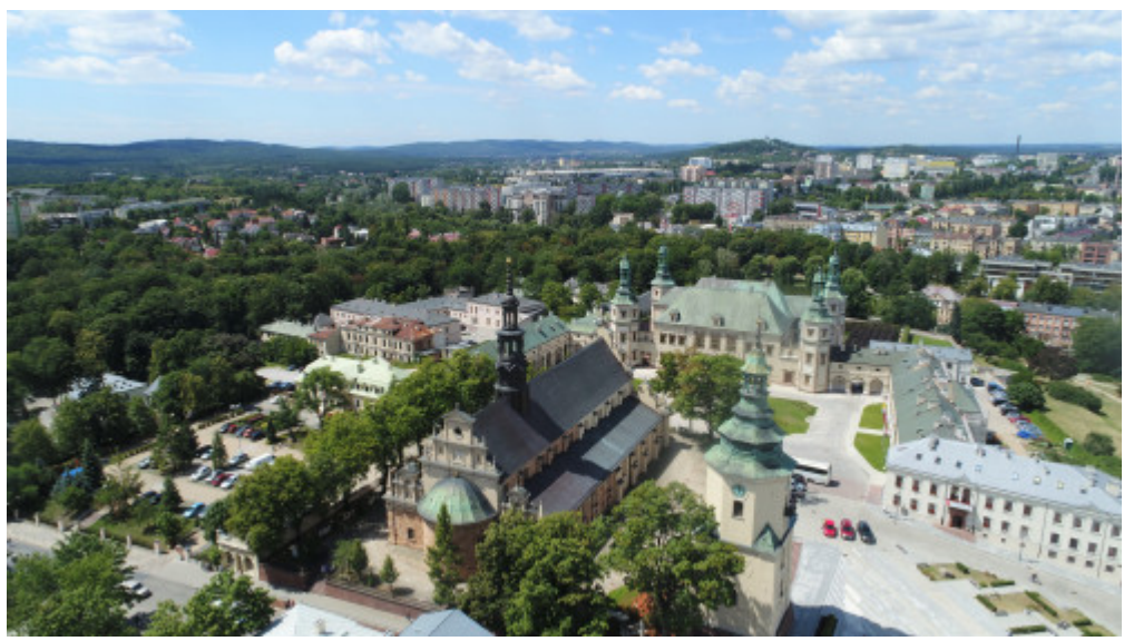
The Cathedral Hill in Kielce

Kielce is the capital of the Świętokrzyskie voivodship. It is situated at the heart of the region. There are five geological reserves in the city so it is a paradise for lovers of geology. They can discover some interesting facts of the earth's history, natural and landscape values.