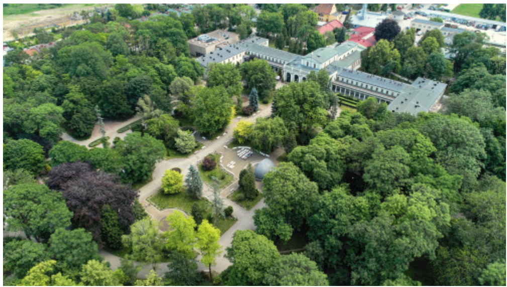
The Busko-Zdrój Health Resorts