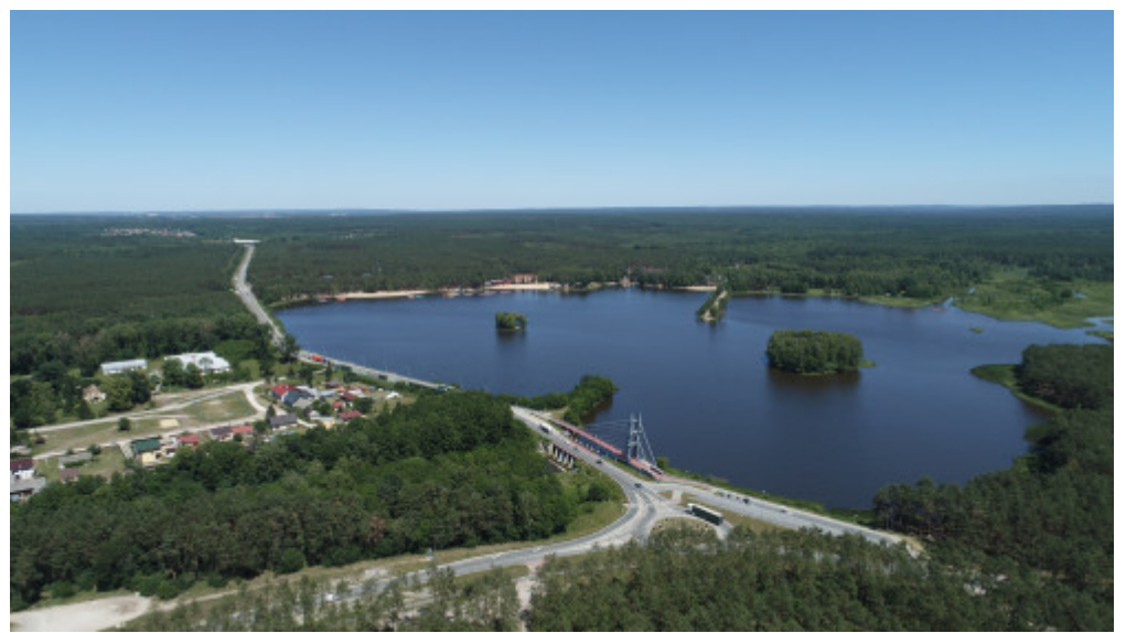
The water reservoir in Sielpia is very popular in a holiday season