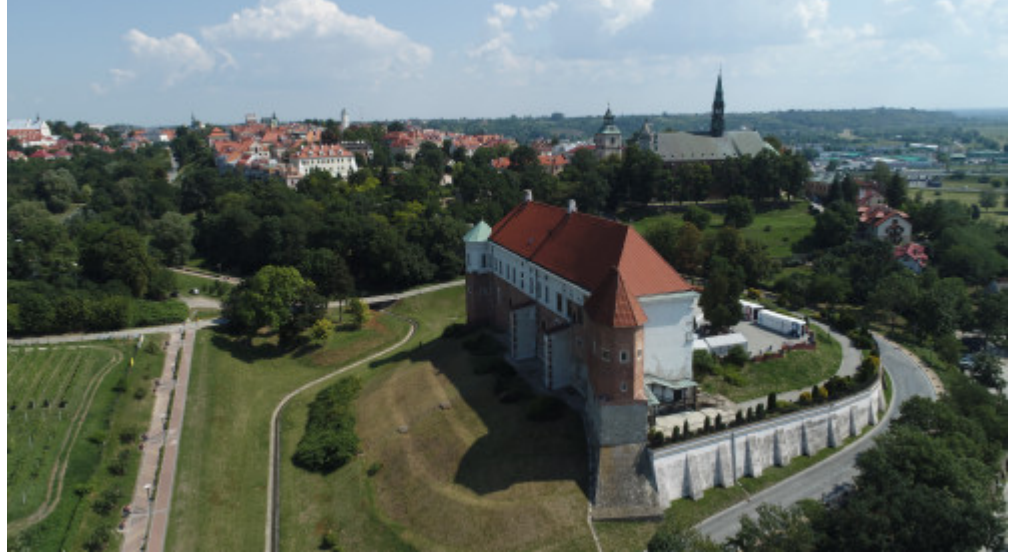
The Royal Castle in Sandomierz

Going along the Vistula River we reach Sandomierz, called the gem of the Świętokrzyski region. It is one of the oldest and most historically meaningful cities in Poland, mentioned in