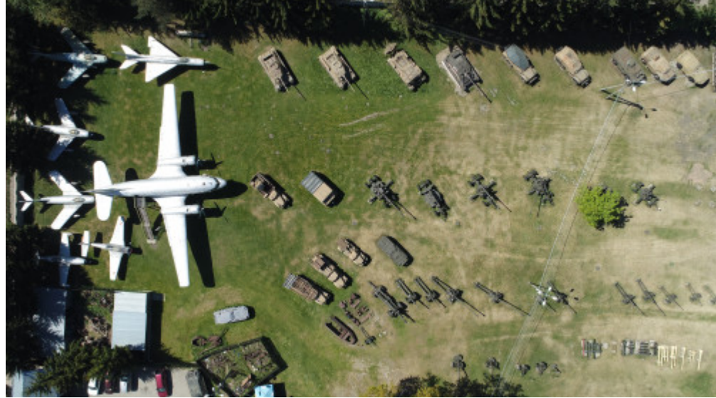
The Museum of the White Eagle in Skarżysko-Kamienna

Wąchock is associated with the Cistercian tradition. The monks were brought there at the beginning of 12th century. They contributed to the development of agriculture, established stone workshops, looms, quarries and metallurgical furnaces. However, the history of this