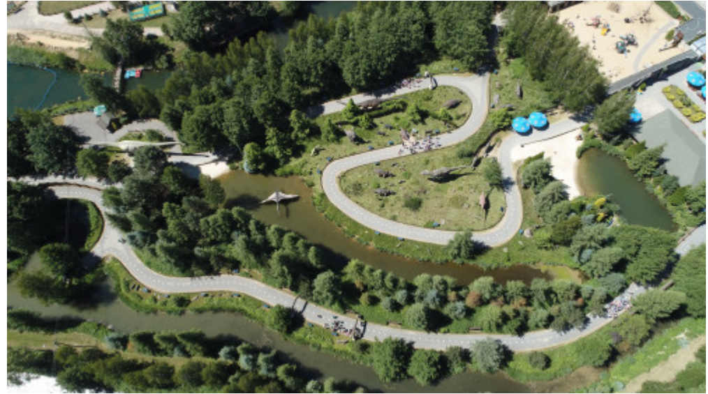
The Bałtów Jurassic Park

The journey through the Świętokrzyskie region continues following the valley of the Kamienna river. We reach the Neolithic flint mines in Krzemionki. It is a unique place, in which striped flint was exploited and processed 5 thousand years B. C. The blades of axes and chisels were made of flint at that time. These days, there is a preserve there, including mine corridors, shafts, mine tips, and a Neolithic settlement that is a reconstruction of that of the Stone Age and the early Bronze Age. The prehistoric world is also available for tourists in the Bałtów Jurassic Park. According to the legends told by the local residents, the devil impressed his footprint on a rock in the river valley. It led scientists to discover the tracks of three species of dinosaurs. Nowadays tourists can admire the reconstructed forms of primeval animals in their natural sizes. In Bałtów, a world of extinct creatures coexists with the present fauna. Many species of animals from far away continents live in the Bałtów preserve called Zwierzyniec. There are mouflons, llamas, camels, boar, exotic sheep and goats, antelopes, ostriches etc. Young and elderly guests, who yearn for thrills, can visit the Witch Village, the Land of Horses, the amusement park, and - in winter - the Santa Claus Village. Skiers can enjoy the Bałtów ski slope called the "Bałtów Switzerland" during the season.